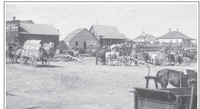
Freighters camped in Shaniko 1910